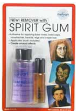
A0118A/R Spirit Gum & Remover

Mask cover is the premier choice of professional special effects artists for its incredible effectiveness in covering latex and rubber prosthetics, bald caps, etc. Provides complete coverage and easy blending necessary for realistic results.