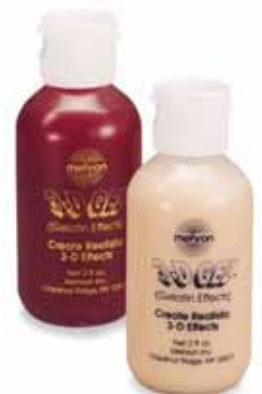
A0142 3-D Gel .5 oz. A0142-2 3-D Gel 2 oz. A0142-8 3-D Gel 8 oz. A0142R 3-D Blood Gel Red .5 oz. A0142R-2 3-D Blood Gel Red 2 oz. A0142-8 3-D Blood Gel Red. The most ghoulish effects are created with 3D Gel. Immerse in hot water for a few minutes until it becomes liquid and then apply.