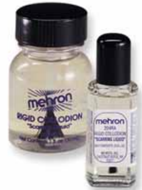
A0204RA Rigid Collodian 1/4oz. A0204 Rigid Collodian 1oz. A clear solution that wrinkles the skin as it dries, creating a scar effect. Repeat application to deepen the effects. Remove by peeling off.