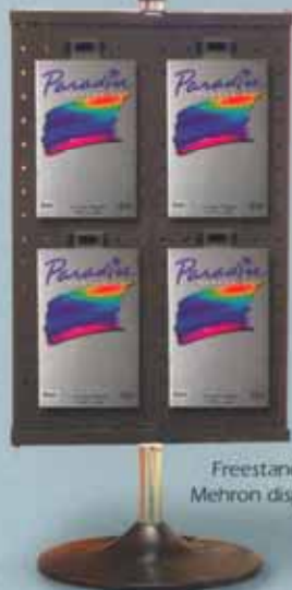
Freestanding Mehron display