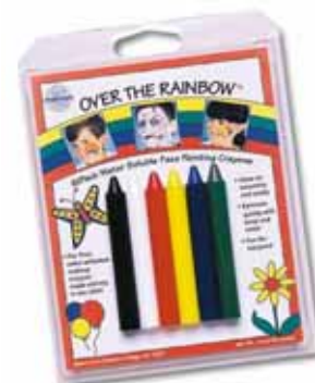
A0433 Over the Rainbow Six brilliant, water-activated colors provide outstanding coverage for quick and easy face painting.