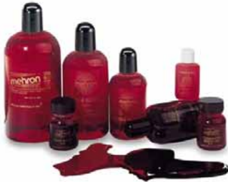
A0152P Stage Blood .5 oz. A0152 Stage Blood 1 oz. A0152-4 Stage Blood 4.5 oz. A0152-9 Stage Blood 9 oz. A0152-16 Stage Blood 16 oz. A0152-GAL Stage Blood Gallon A0152D Dark Blood 1 oz. A0152-4 Dark Blood 4.5 oz. A0152-9 Dark Blood 9 oz. A0152-16 Dark Blood 16 oz. A0152CAP Blood Capsules (12 Pack) A0152PCAP Blood Capsules (6 Pack w/ Blood) A0150C Squirt Blood .5 oz. A0150 Squirt Blood 1 oz. A0150-2 Squirt Blood 2 oz. A0150-9 Squirt Blood 9 oz. A0150DC Squirt Dark Blood .5 oz. A0150D Squirt Dark Blood 1 oz. A0150-2 Squirt Dark Blood 2 oz. A0140-9 Squirt Dark Blood 9 oz.

This viscous, lifelike blood is non-toxic and so safe it's edible. Can be used in and around the mouth.