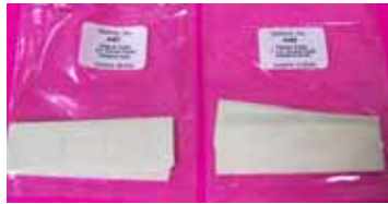
A0356 AdMed Adhesive Strips A0357 AdMed Adhesive Dots