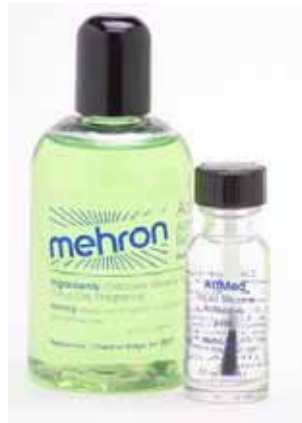
A0355 AdMed Adhesive Mehron offers this clear synthetic adhesive that stands up to the toughest performance conditions. Best of all, it will not break down from sweat. A0355R AdMed Adhesive Remover This special formula has been developed to break down and remove medical adhesive.