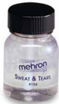
A0154 Sweat & Tears 1 oz. A0154-4 Sweat & Tears 4.5 oz. When the mood's not there, sweat & tears will emote for you.