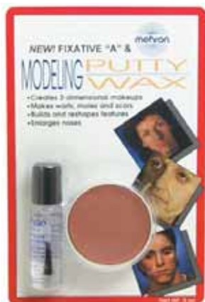
A0140 Modeling Putty Wax 1 oz. A0140-8 Modeling Putty Wax 8 oz. A0140C Modeling Putty Wax 1 oz. Carded

Create three-dimensional facial features. For extra adhesion, apply spirit gum first. Seal with fixative "A" before applying makeup.