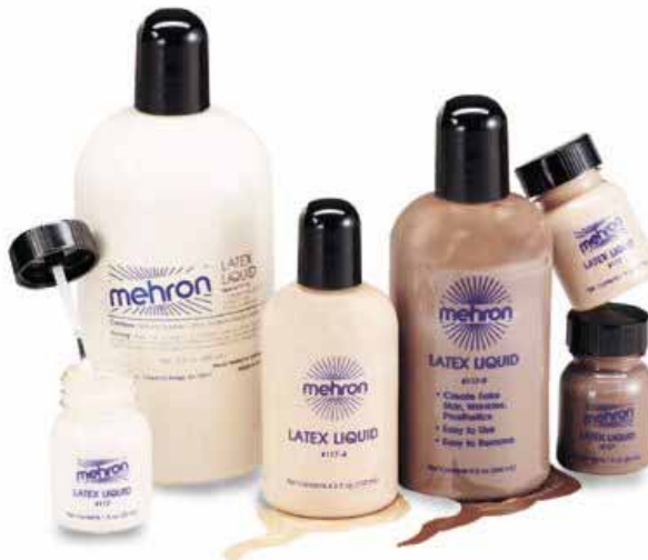
A0117 Clear Latex 1 oz. A0117-4 Clear Latex 4.5 oz. A0117-9 Clear Latex 9 oz. A0117-16 Clear Latex 16 oz. A0117-GAL Clear Latex , GALLON A0117D Dark Flesh Latex 1 oz. A0117D-4 Dark Flesh Latex 4.5 oz. A0117D-9 Dark Flesh Latex 9 oz. A0117D-16 Dark Flesh Latex 16 oz. A0117D-GAL Dark Flesh Latex, Gallon A0117L Light Flesh Latex 1 oz. A0117L-4 Light Flesh Latex 4.5 oz. A0117L-9 Light Flesh Latex 9 oz. A0117L-16 Light Flesh Latex 16 oz. A0117L-GAL Light Flesh Latex , Gallon

This viscous, lifelike blood is non-toxic and so safe it's edible. Can be used in and around the mouth.